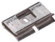
PN#180190 Bridge Clips Bag of 100pcs

The RSC 1000 Remote Site Controller Bundle Includes: