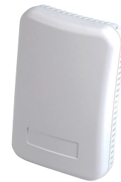
PN#150749 Zone temperature sensor (thermistor)/Humidity (3%/4-20mA) Wall Mount