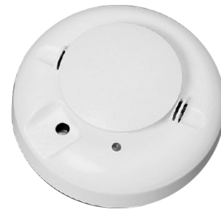
PN#300136 Smoke Detector - A low profile, self-diagnostic, four-wire photoelectric smoke detector with a built-in sounder. 12/24VDC