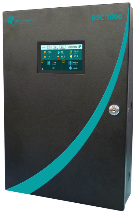
PN#150982-1 RSC 1000 Site Controller, Intelligent Control and Monitoring System for remote facilities with One or Two Air Conditioning Units.